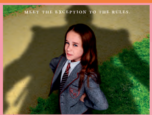
MATILDA NETFLIX SUBSCRIPTION

Ms. Marvel follows a young Pakistani American Marvel fan who gains powers of her own - discovering what it means to be a superhero, while also balancing her schoolwork and family commitments. This show is fresh and vibrant, gripping you from the start. For someone like me, who knows very little about Islam and Pakistani immigrant life in New Jersey, Ms. Marvel teaches you plenty, while at every turn keeping you entertained and gripped with its action, humor, stunning visuals, amazing cast, and beautifully relatable story. And although Kamala is SERIOUS Marvel fan, you don't have to be to love this show and everything it has to offer.