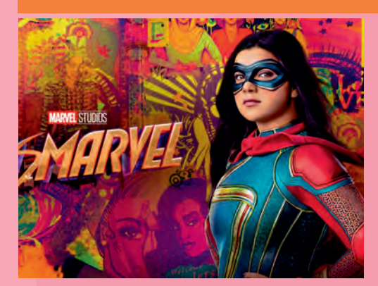
MS. MARVEL DISNEY PLUS

The creator behind this channel also produces longer-form educational videos on a different channel, Wendover Productions.